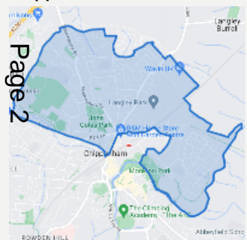
Chippenham Town North East