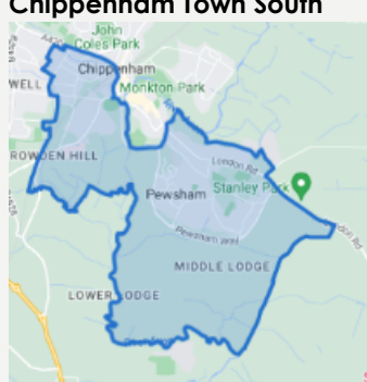
Chippenham Town South